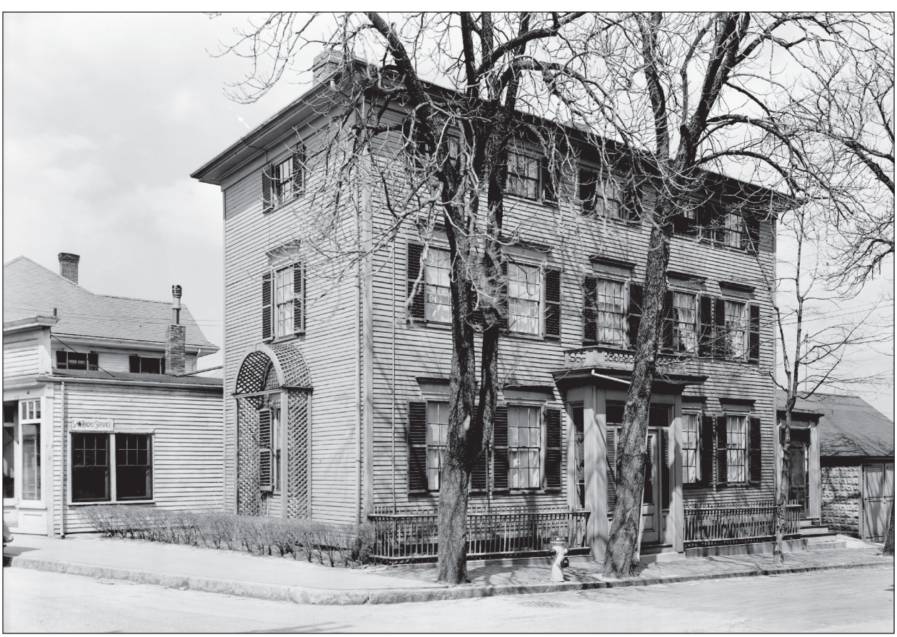
Thibault House, 8 Summer Street (Photo #1). Exterior - general view from the southeast. Photo for the Historic American Buildings Survey by Arthur C. Haskell, June 1934. Reproduction Number: HABS MASS, 5-NEWBP, 20-1.

The HABS and The HABs Nots: Documenting the Architecture of Newburyport in the Historic American Buildings Survey